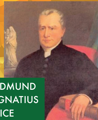
EDMUND IGNATIUS RICE