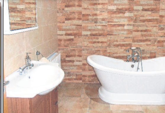
■ ATMOSPHERIC: The decor, appliances, fittings and attention to detail in Caitlin's Cottage exude an atmosphere of a by-gone age within a modern and convenient setting. FW-1N.