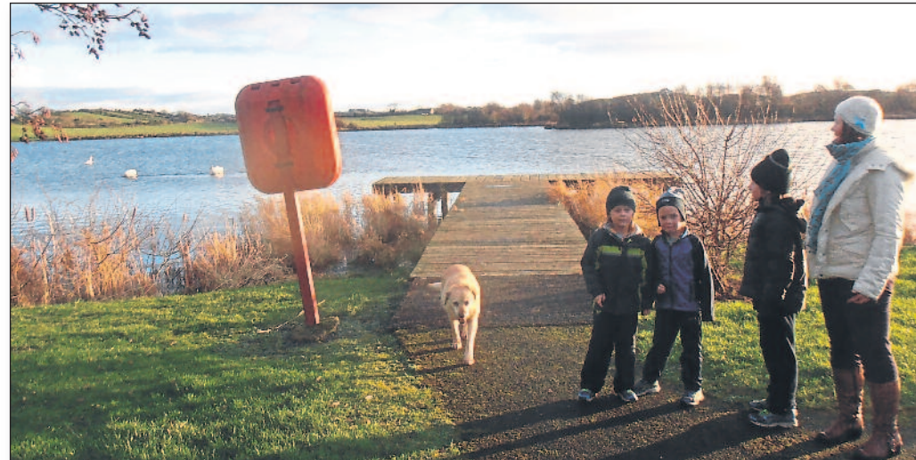
■ COUNTRY WALKS: A local farming family enjoys a post Christmas walk and the pretty lakeside views of Kiltybane Lake, Cullyhanna, south Armagh. FW-1D.

There's a utility room with washing machine, tumbler dryer, etc, and outside, a separate building for wet gear storage including