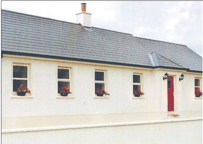
■ SELF CATERING: Caitlin's Cottage, a tastefully restored and upgraded traditional cottage in the townland of Kiltybane, Cullyhanna, in south Armagh, sleeps six with comfort and offers guests an outdoor adventure in a stunning rural setting. FW-1H.

beyond it. "There are lots of crannogs on lakes around here since we have no fewer than 14 lakes in the general area, not to mention the famous 3,000 year old Annaghmare Horned Cairn or tomb. "So when you stop to think about it, we not only have extraordinary rural beauty and wildlife all around us, but a wealth of historical sites of archaeological interest too," remarked Cathal as we drove off, returning to Caitlin's Cottage, where I'd first met up with him earlier that afternoon.