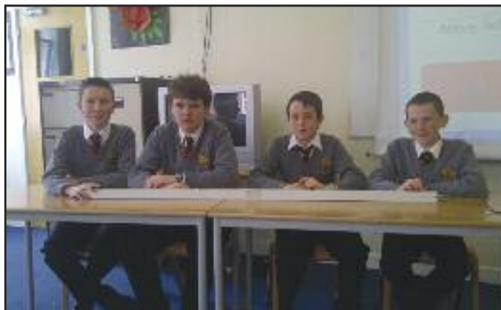
The Successful Abbey Quiz Team.

We awoke early and had our breakfast. We then travelled by train from Southampton to Winchester where the quiz would be held. A