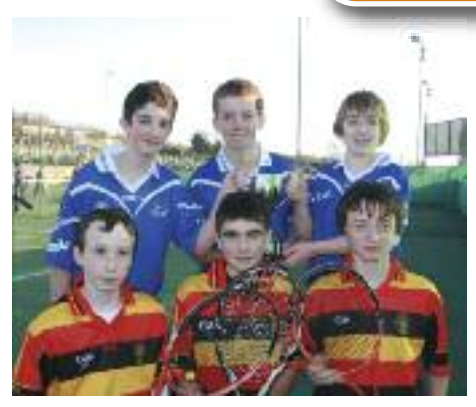
The Abbey and St. Colman's Tennis Teams

At the conclusion of the championships the organizers thanked the players and schools for their commitment and commended the high standard of tennis and sportsmanship. The local tennis clubs were thanked for helping to make the event such a success.