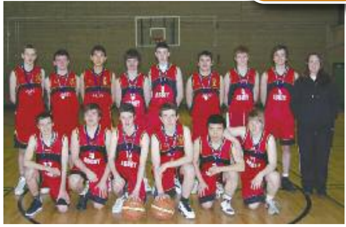
Ulster Under 19 Basketball Champions

St Michael's, Lurgan, made it to the league final also and were looking to settle a score with the Abbey boys. St Michael's came out fighting and had the first score of the game. The Abbey fought back with 2 consecutive scores and after that St Michael's were playing catch up with the first quarter ending on 16 - 9 to the Abbey. St Michael's came back strong in the second quarter scoring 9 points to the Abbey's 10.