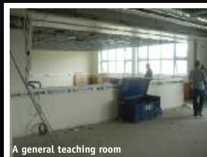
A general teaching room