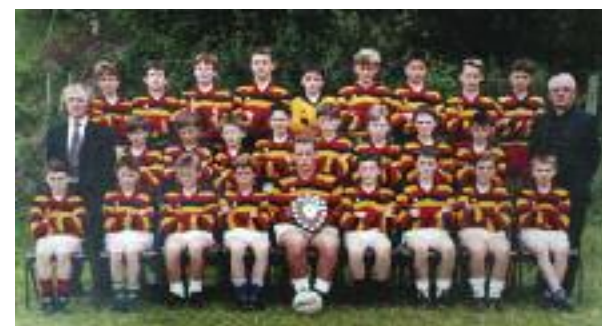
The 1990 Ben Dearg Shield winners