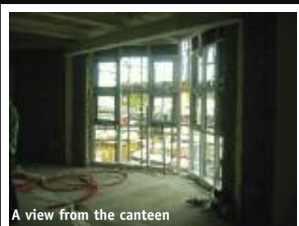
A view from the canteen

It has been confirmed that Monday 7th December 2009 will be a significant day in the history of the Abbey Grammar School. When staff arrive at work that day, they will leave behind the fabled corridors of Courtenay Hill and head in the direction of the Castlewen Site, the home of the New Abbey. Niall Burns, Donard 3, gives us a bird's-eye-view of what we can expect when the dream finally becomes a reality. Slí na Mainistreach is delighted to show case the very latest images of the New Building.