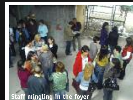
Staff mingling in the foyer