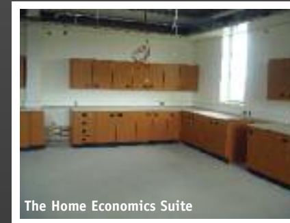
The Home Economics Suite