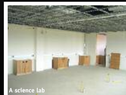
A science lab