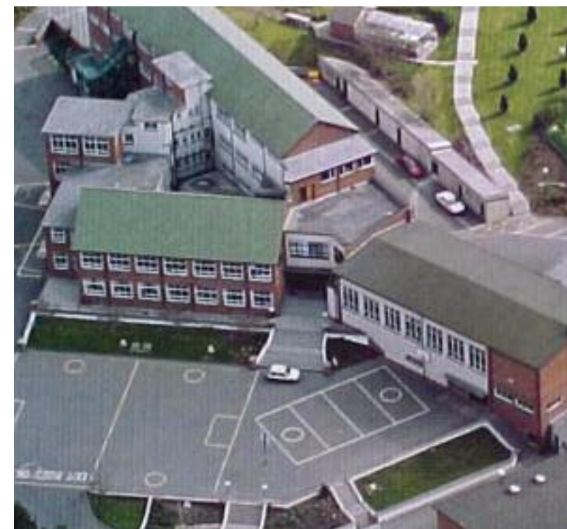
An aerial view of the current site in the early 90's

Leaving the Abbey Primary School in June of 1988, there was only one place that I wished to go to further my education. For me the step of transferring from the Abbey Primary to the Abbey Grammar was as logical as night following day. When I began on the first of September 1988, I immediately felt as though I had come 'home'- such was the atmosphere generated by the staff and pupils. When I finished my A Levels in 1995 the Abbey had gone through massive changes, which in my view were for the better. There is one anticipated change, however, that did not occur, despite very strong rumours- I did not get to become one of the first group of Sixth Year students to move to a touted New Abbey building!