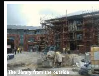
The library from the outside