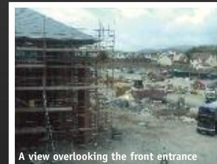
A view overlooking the front entrance