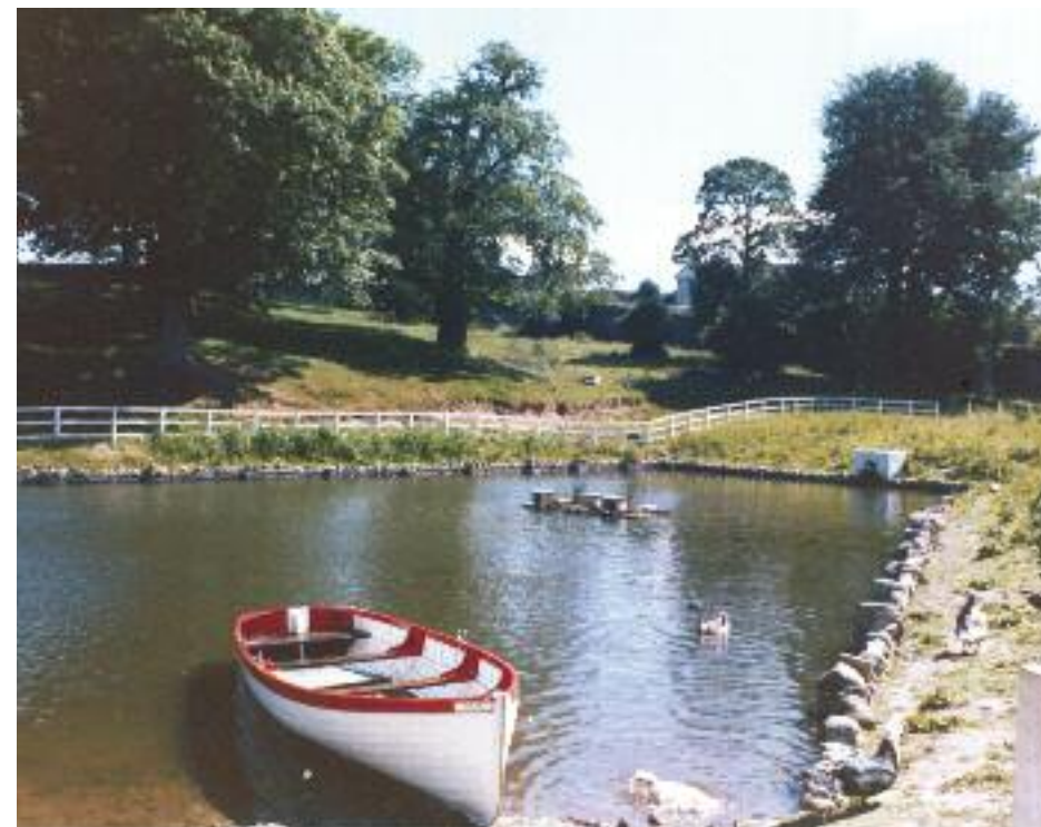
The Pond: now the new extension, provided the venue for many nature walks