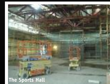
The Sports Hall