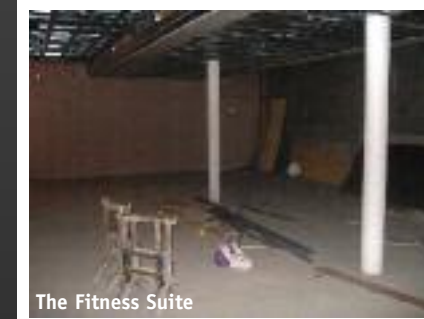
The Fitness Suite