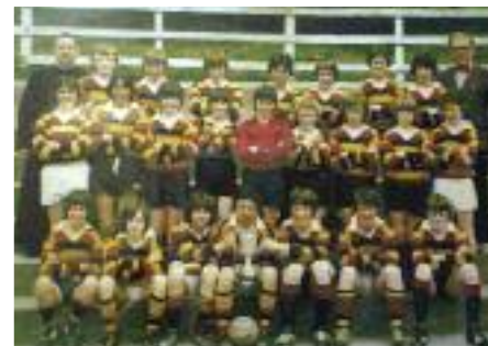
The 1977 McMahon Cup Team pictured on the steps of the "Handball Alley"