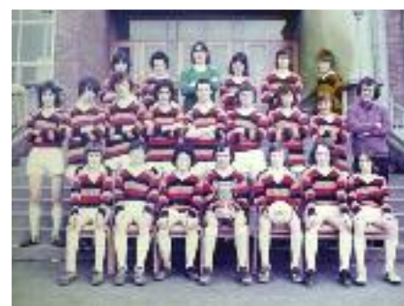
The 1974 McMahon Cup Team