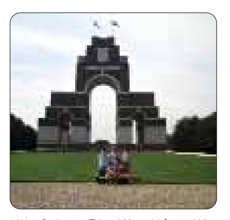
' Abbey Students at Thiepval Memorial, Somme Valley. This memorial contains the names of over 72 000 missing soldiers who have no known grave'.